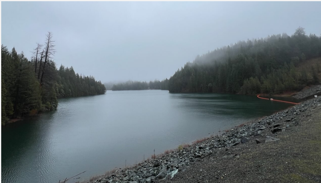
Sugar Pine Reservoir Picture Taken 2/14/2025

The Foresthill Public Utility District was formed in 1950. We are one of many Special Districts in Placer County. Special districts stand out because they are dedicated professionals offering specialized services at the request of the voters in their area. Special districts are created and funded by a community's residents to provide new or enhanced local services and infrastructure. Nearly every one of California's 39 million residents receives at least one essential service from California's 2,000 independent special districts. — CSDA